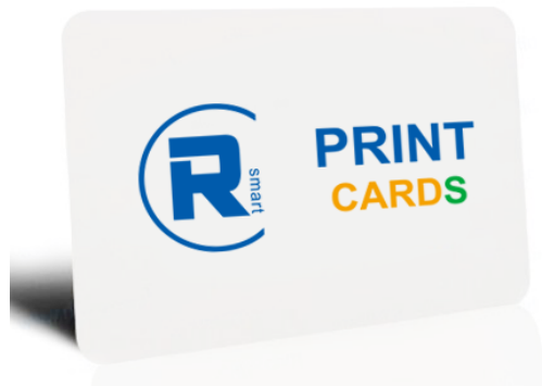
实物图 (Product Image)